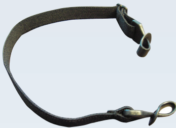
Included Adjustable Length Elastic Strap

UV Protection Anti Fog Medium Impact Positive Seal Distortion Free Lens Wrap Around Light Weight