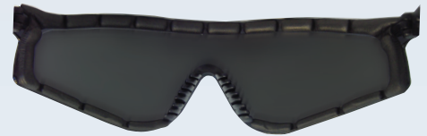
Ribbed Nose Piece with Positive Seal EVA Foam

The 359 Slingshot is a positive seal pair of safety glasses with a durable EVA foam cell.